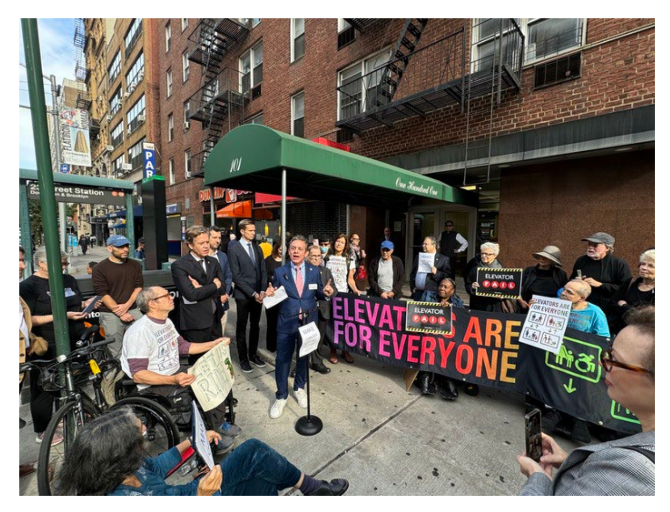
Speaking at our elevator and congestion pricing rally in Chelsea

<u>I applaud Governor Hochul for bringing congestion pricing online at this pivotal moment for our transit system</u>. There is not, has never been, and never will be a substitute for the funding promised through congestion pricing. Mass transit is the backbone of our city and state, which are the economic engine for the nation.