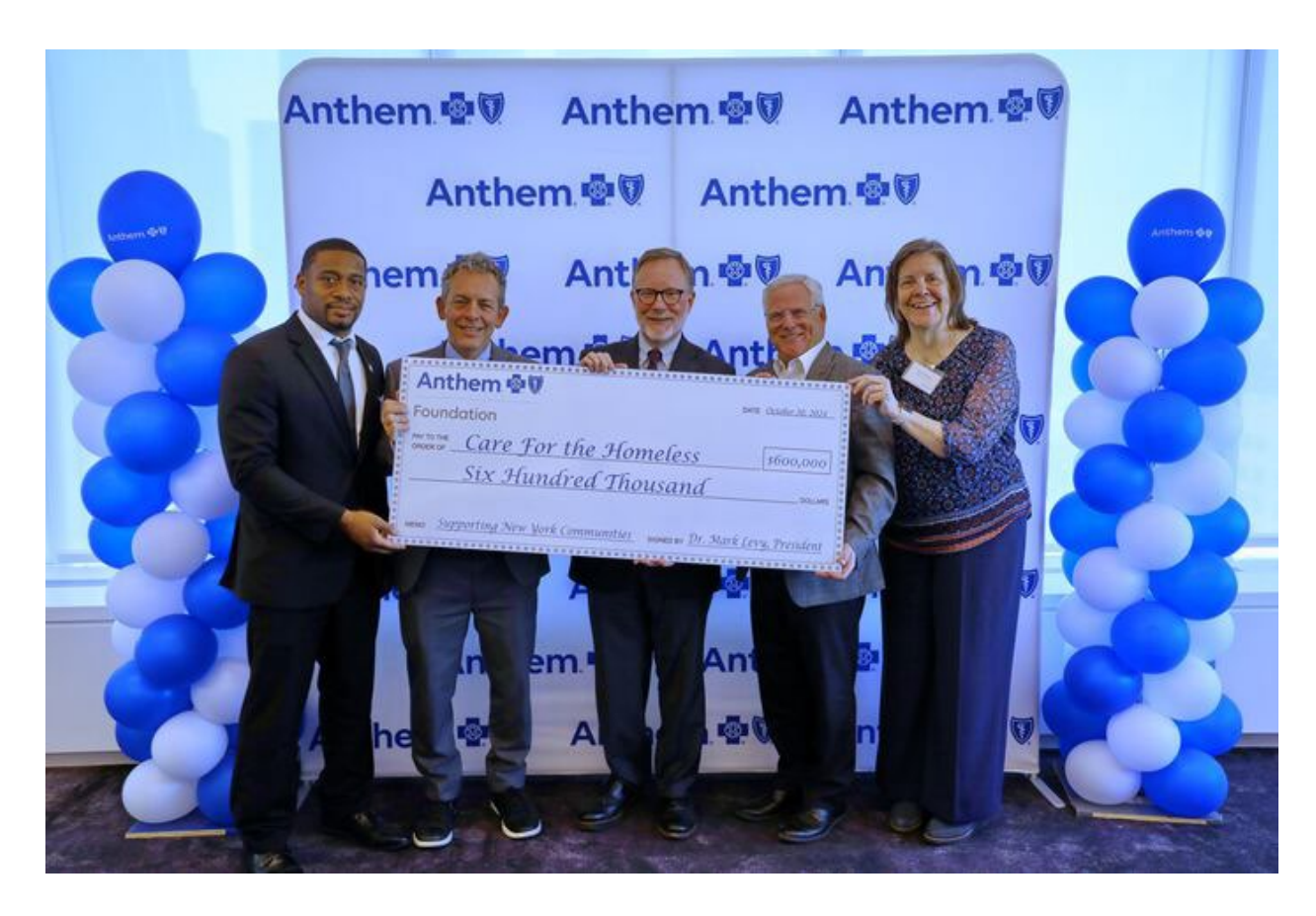
Presenting a $600K grant for Care for the Homeless to support their work addressing mental health and substance use disorders in the unhoused community

To get people suffering from severe mental illness off of the streets and connected with support we must get them into supportive housing with adequate services. I had the opportunity to join St. Francis Friends of the Poor at one of their permanent supportive housing facilities. Their facility is a pioneer in the field of supportive housing. Their services help keep our most vulnerable neighbors healthy and housed. I learned about how their program gets people with chronic mental illness the support they need and uplifts the surrounding neighborhood.