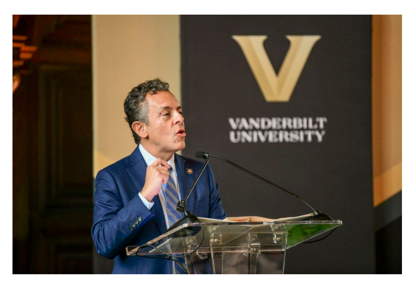
Speaking at the General Theological Seminary while celebrating Vanderbilt Universities assumption of ownership of the property and arrival in the Chelsea Community

I am pleased to share that Vanderbilt University will be coming to West Chelsea in the beautiful and storied General Theological Seminary. I look forward to new partnerships, community opportunities, and the renewed vitality of this historic campus!