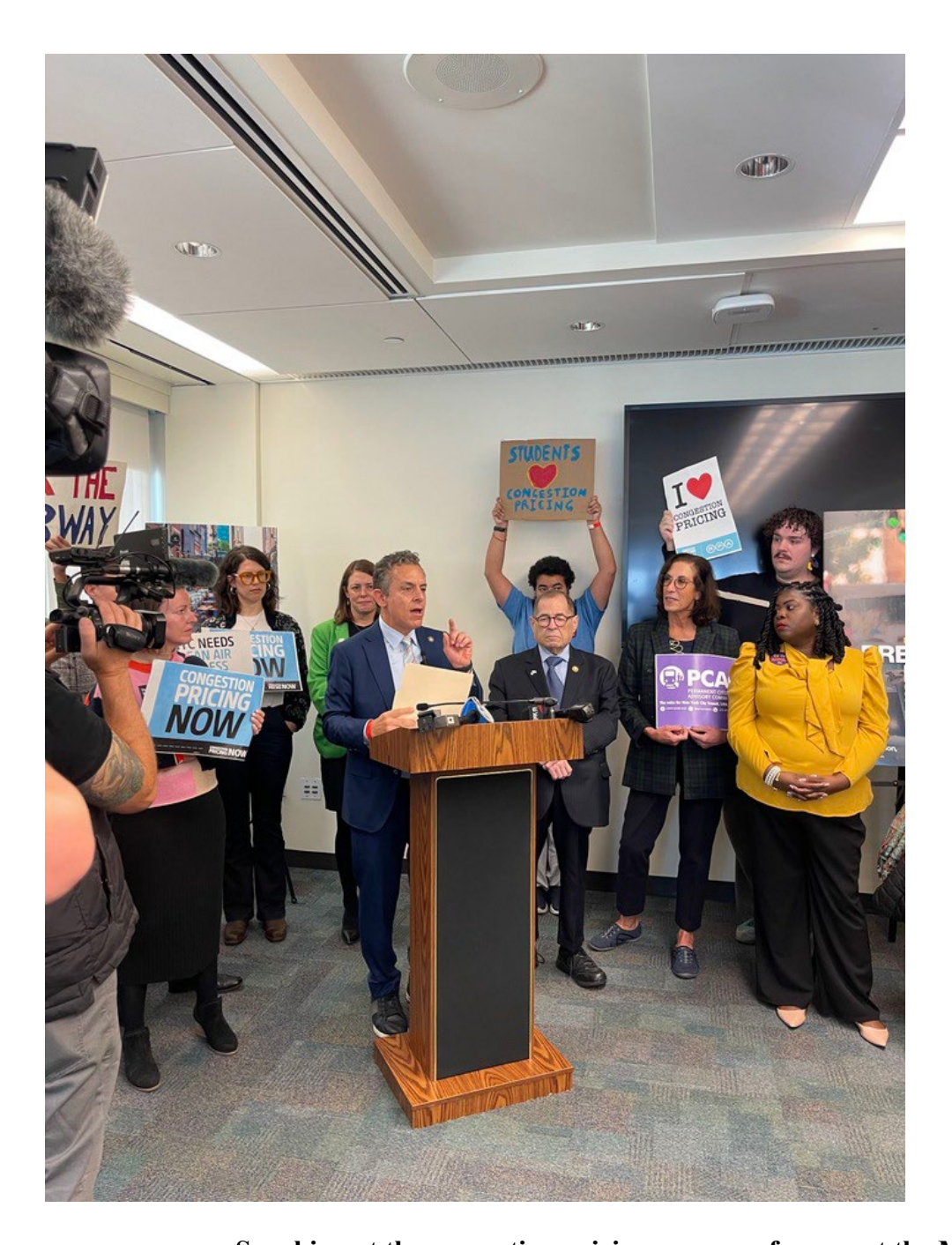
Speaking at the congestion pricing press conference at the MTA HQ

You can learn more about the Governor's new plan here.