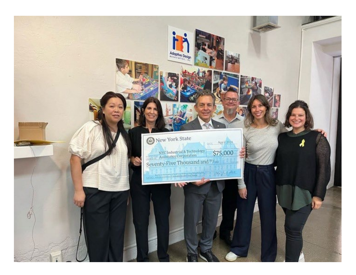
Presenting a $75K check for ITAC to support small manufacturers in the district