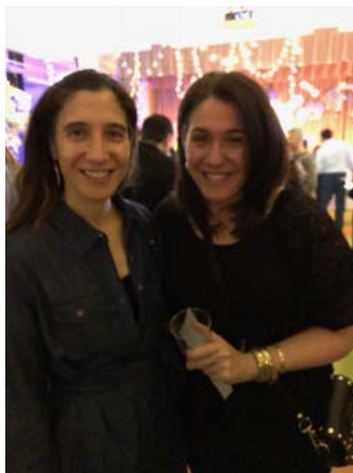
PTA Moms and Activists