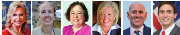
Congresswoman CAROLYN MALONEY

LEARN ABOUT TENANTS' RIGHTS, EXEMPTIONS FROM RENT INCREASES FOR SENIORS AND DISABLED, HOW YOU CAN FIGHT RENT INCREASES ON STABILIZED APARTMENTS, WIN A RENT FREEZE, AND GET YOUR QUESTIONS ANSWERED BY ATTORNEYS.