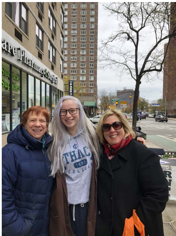
Standing with constituents who braved the cold to shred old documents.