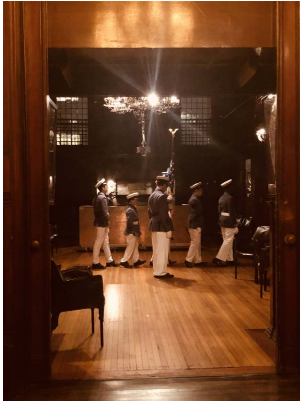
The Knickerbocker Greys entering the Veterans Room to present the colors.