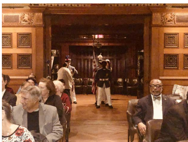
The Knickerbocker Greys, founded in 1881, is a non-profit and the oldest after school program for children ages 6 to 16 in New York City.