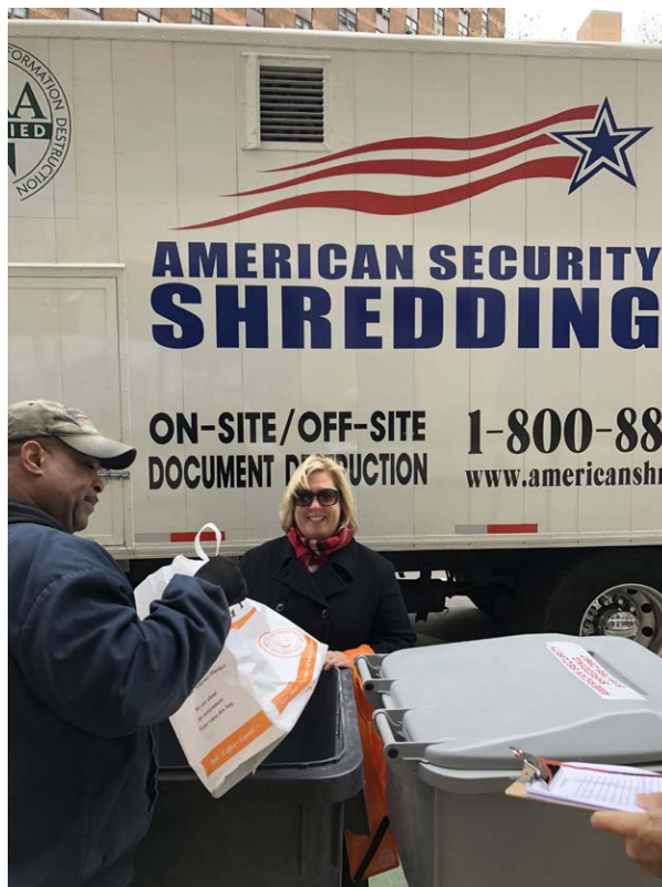
Assembly Member Seawright is pleased to provide grant funding to the Upper Green Side non-profit to help constituents protect their identity.