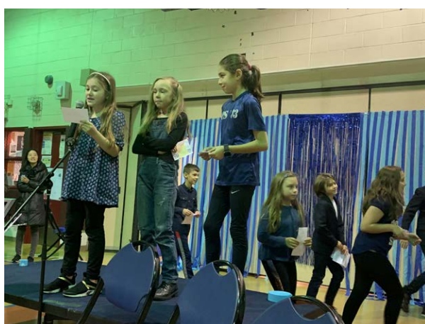
Fifth grade students spoke about what PS183 means to them.