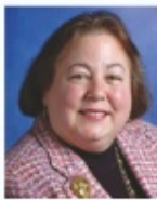
State Senator LIZ KRUEGER