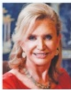
Congresswoman CAROLYN MALONEY