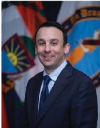
NEW YORK CITY COUNCIL MEMBER KEITH POWERS