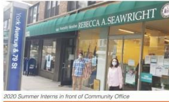
2020 Summer Interns in front of Community Office