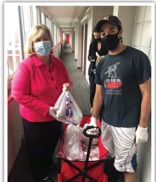
Delivering senior meals to those who were homebound during the pandemic.