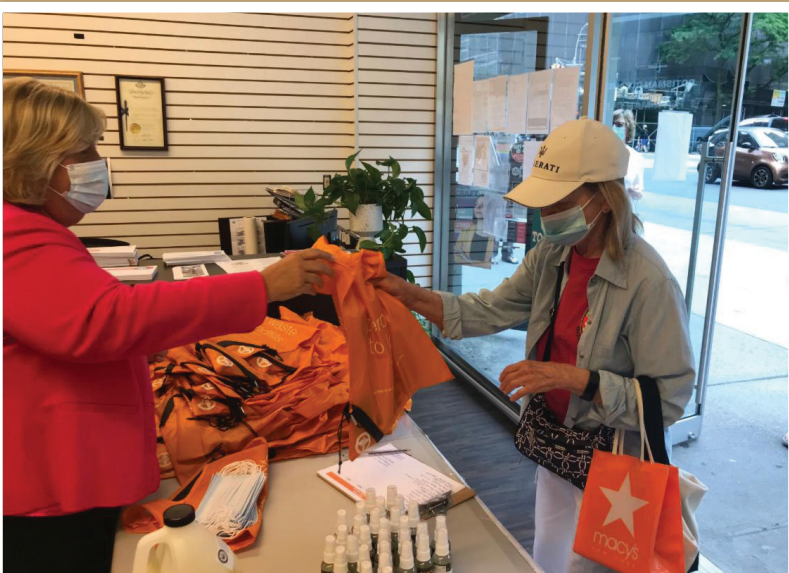
Our district office is here for you! Please stop by to have your questions answered, or to pick up Personal Protective Equipment (PPE).