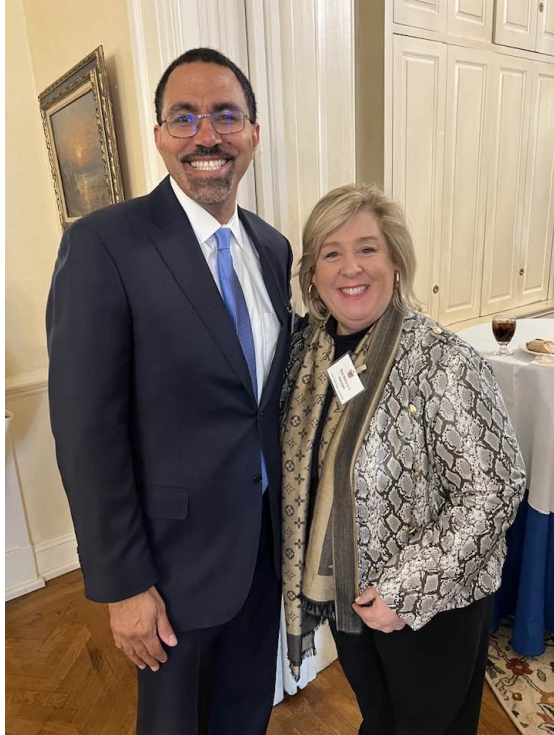
SUNY Chancellor Dr. John King a strong supporter of additional resources for students with disabilities.