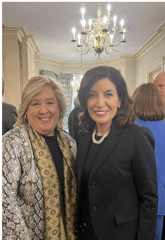
Following the State of the State address, a reception was held at the Governor's Mansion.