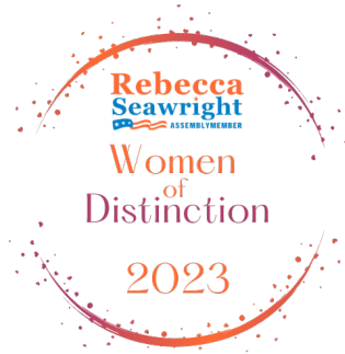
Susy del Campo