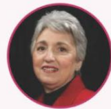
Eleanor Smeal President and Co-Founder, the Feminist Majority Foundation