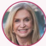
Hon. Carolyn Maloney Roosevelt House Eleanor Roosevelt Distinguished Leader in Residence