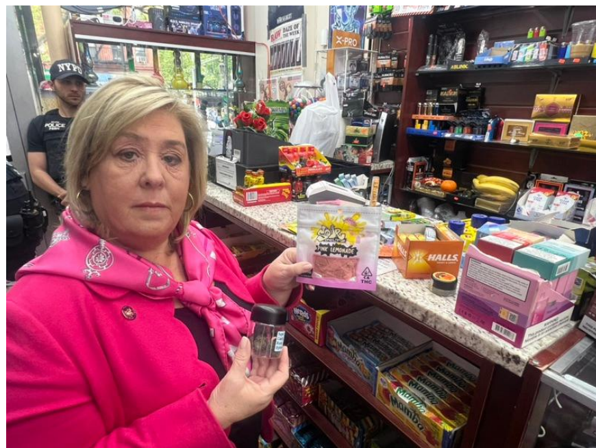
The cannabis products seized included packaging that targets children with bright colors, sweet flavoring, and common name brands.