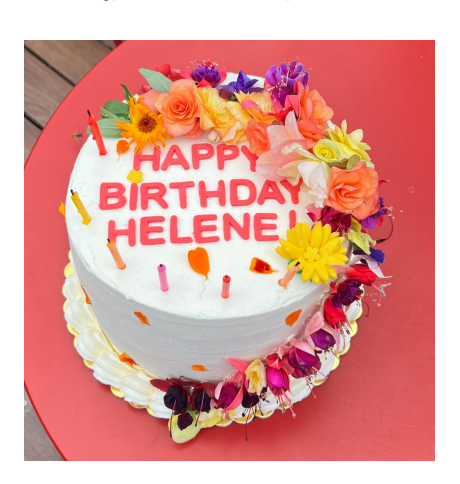
Honoring French Heritage Society Board Members