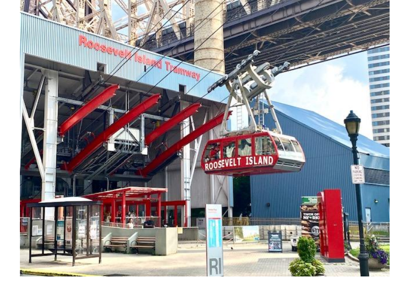
A Message from the Roosevelt Island Operating Corporation (RIOC) Transportation Department