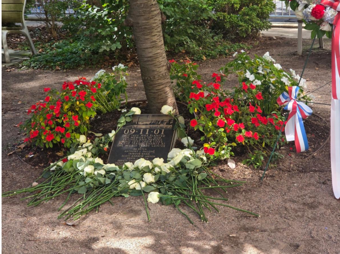
Floral wreath and white roses placed at the 9/11 Roosevelt Island Memorial.