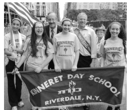
Assemblyman Dinowitz attended this year's Annual Celebrate Israel Parade in support of Israel. While there, the Assemblyman met with many recognizable faces including New York City Mayor de Blasio and Congressman Eliot Engel, as well as students from SAR Academy and Kinneret Day School.