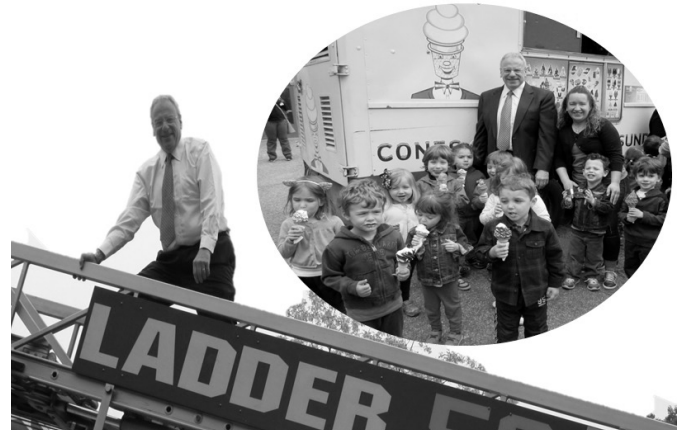
Assemblyman Dinowitz attended this year's annual Truck Day at the Riverdale Temple Nursery School. It was a day full of laughter, adventure, and of course, ice cream.

A Beatles cover band that plays all the classics and have several interesting costume changes throughout the performance. Riverdale YM-YWHA, 7 p.m.