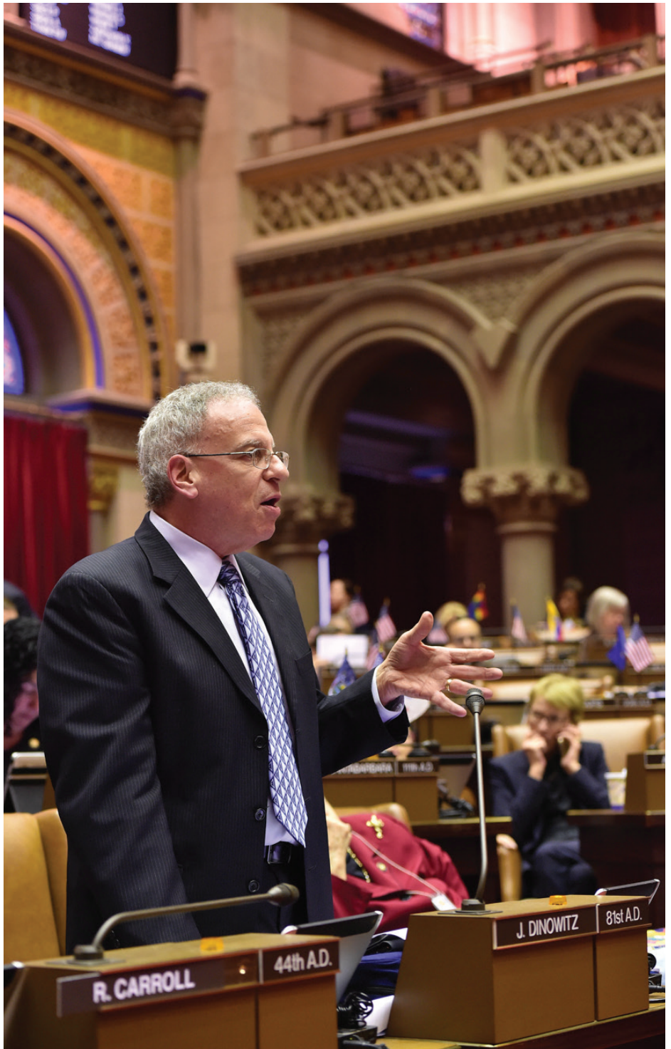
Assemblyman Jeffrey Dinowitz debating legislation in the Assembly Chamber.