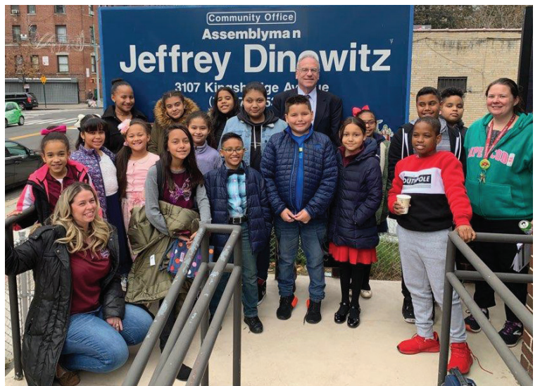
MEETING WITH FUTURE LEADERS FROM PS 7: I had the incredible honor of hosting our future leaders in my office. The Student Leadership team at PS 7 visited my office and we had a lively discussion about how our government is structured, what exactly I do as a member of the New York State Assembly, and how they can best advocate for things they find important. We are in very capable hands!