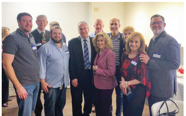
SUPPORTING MERCHANTS: It was great to join the Riverdale Main Streets Alliance at a recent event. Our communities are strong when there is a thriving network of small, locally-owned businesses filling our commercial corridors.

While this will not impact the future congestion surcharge, this will help reduce some of the bridge shopping that was pushing drivers over to the Broadway Bridge and clogging streets in Kingsbridge and Marble Hill. It is hard to quantify the entire impact on traffic from bridge shopping, but any reduction in traffic and congestion will help reduce air pollution and quality of life for people in the Northwest Bronx.