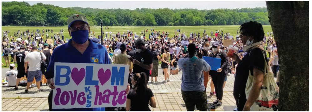
Peaceful demonstration in Van Cortlandt Park after the murder of George Floyd in Minneapolis.

Prohibit Credit History Employer Discrimination: This legislation would prohibit the use of consumer credit history in hiring, employment, and licensing determinations. Credit histories have been shown to often have material errors that go undetected or uncorrected, and there is little to no evidence that shows a correlation between credit history and job performance. The bill has passed in the Assembly but is awaiting action in the State Senate. (A2611)