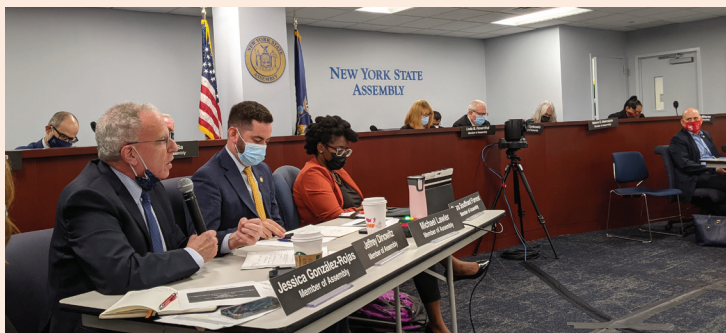
Assemblyman Dinowitz questions leadership from the NYS Office of Temporary and Disability Assistance about the slow rollout of the Emergency Rental Assistance Program.

I am incredibly proud of these two laws, which work in tandem with rent relief programs largely funded by the federal American Rescue