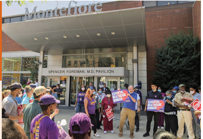
Assemblyman Dinowitz speaks to a crowd of picketing healthcare workers outside of Montefiore Hospital on East Gun Hill Road before joining them on the picket line.

Healthcare workers are vital to our community, but this may have never been more true than during the COVID-19 pandemic. I was proud to join picketing healthcare workers outside of Montefiore Hospital in their fight for a better contract.