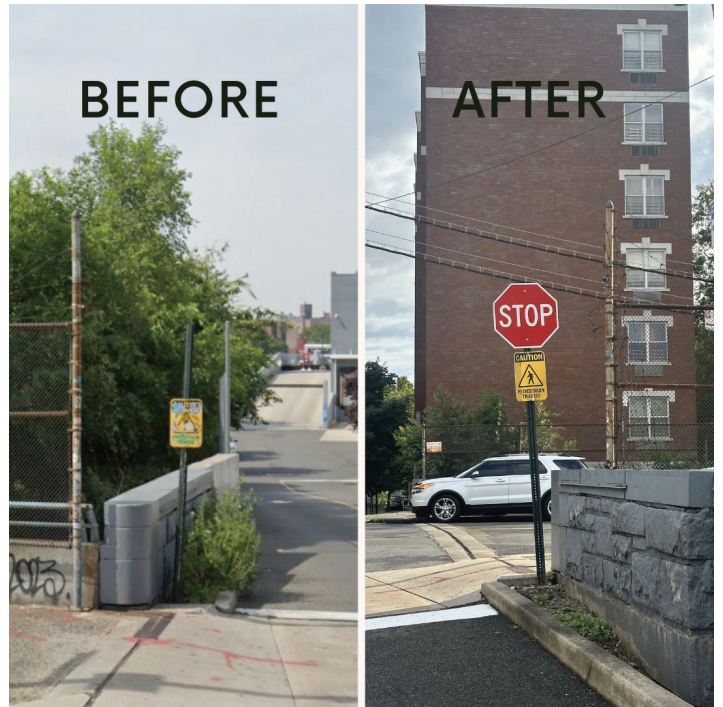
Before and After of the Stop Sign being replaced.

Our office successfully facilitated the replacement of a crucial stop sign that had been removed at the busy intersection of West 238th Street and Putnam Avenue, right by BJ's. This intersection saw significant pedestrian and vehicle traffic, and the missing stop sign posed a severe safety risk to the community. By working swiftly with city officials, we ensured the installation of a new stop sign, reinforcing our commitment to keeping our streets safe for drivers and pedestrians alike.