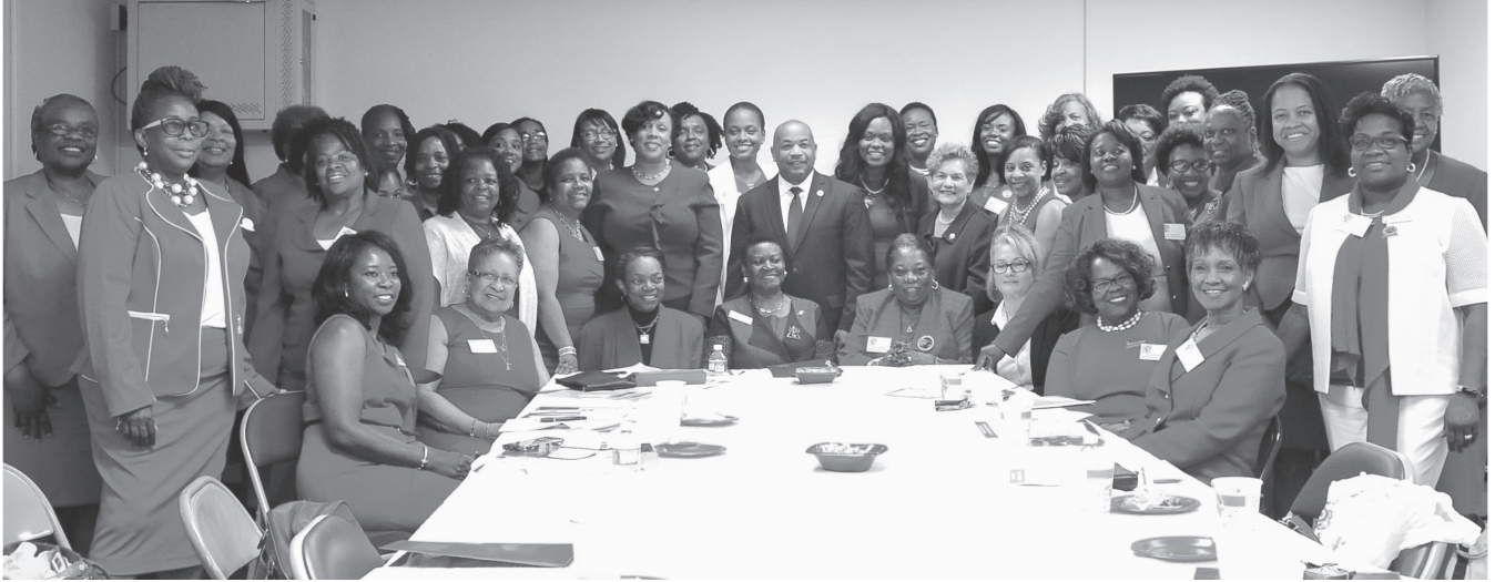
Assemblyman Carl Heastie meets with members of the Delta Sigma Theta sorority during their lobby day.