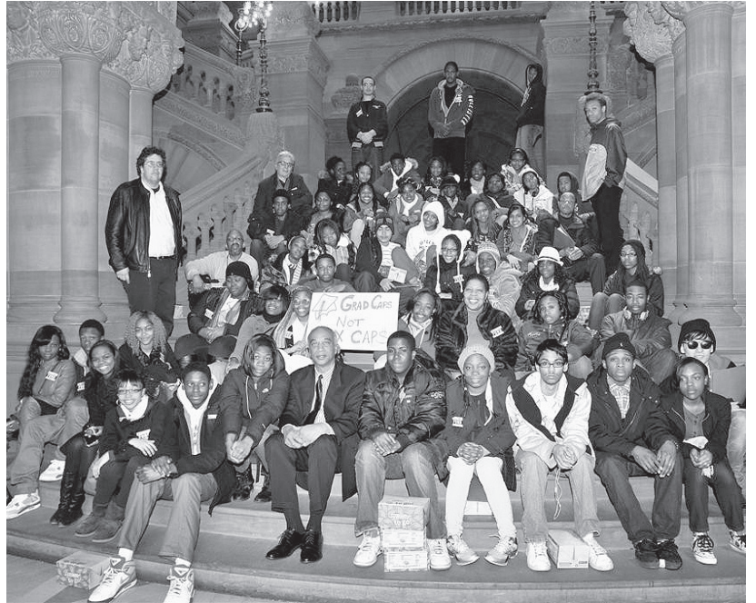
Assemblyman J. Gary Pretlow with the Mount Vernon City Schools.