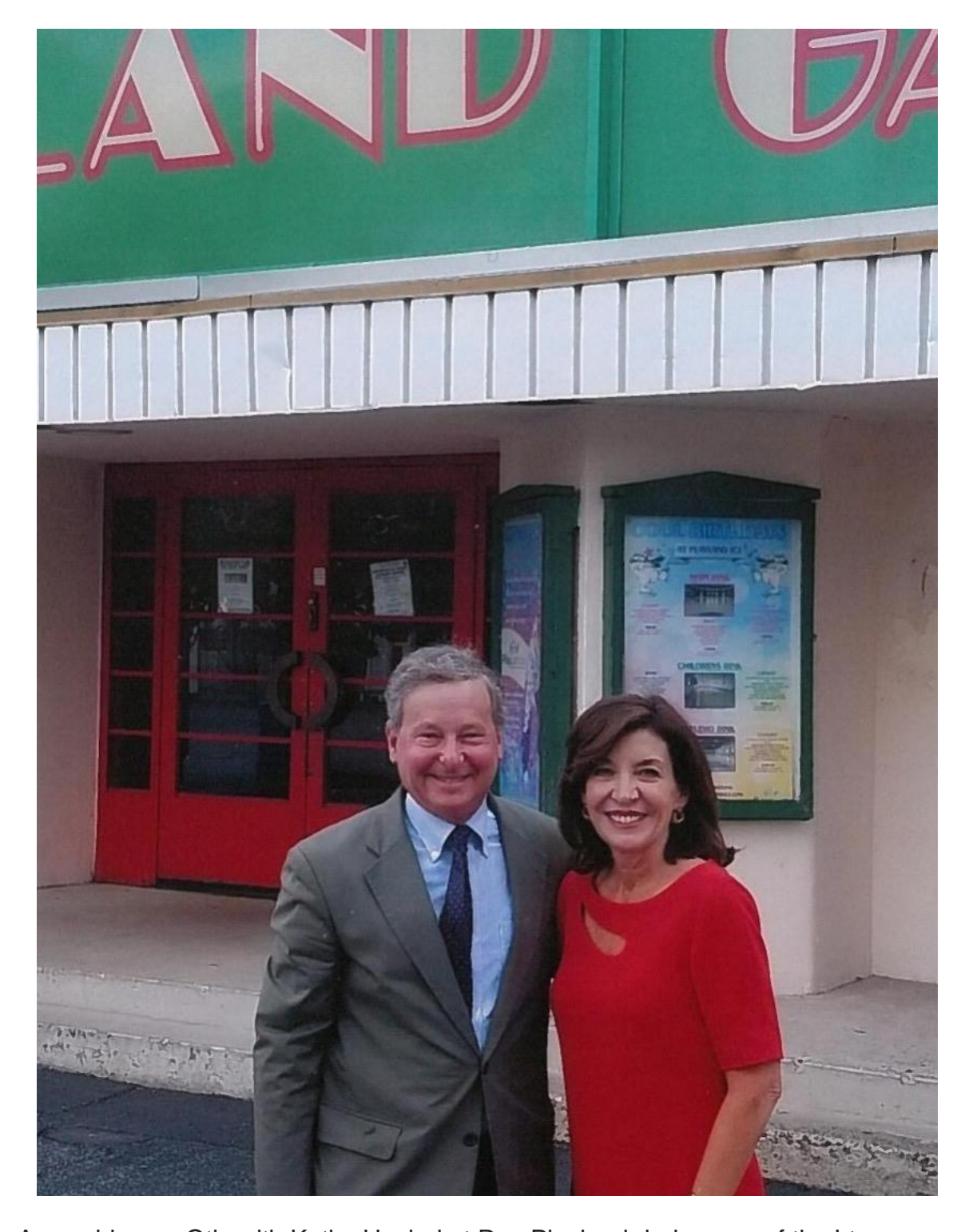
Assemblyman Otis with Kathy Hochul at Rye Playland during one of the Lt. Governor's frequent visits to Westchester.