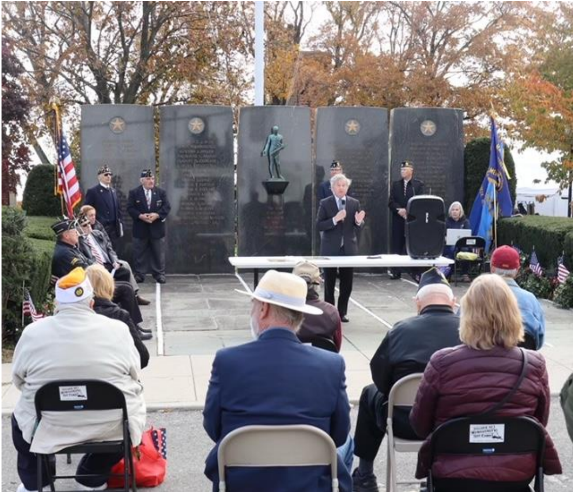
American Legion Post 90, Mamaroneck Veteran's Day Ceremony

Veterans Day was marked by events throughout Westchester and across the country to thank all those men and women who have provided service to our country. Our way of life is made possible through the sacrifice and commitment of the generations who have served our country in the branches of the military. I attended events throughout the Sound Shore. My comments at the American Legion Post 128 City of Rye ceremony are included here .