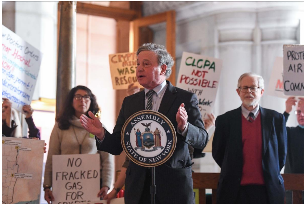
Assemblyman Otis speaking at an Albany press conference earlier this year on the cryptocurrency mining issue.

Legislation I co-sponsored was signed by Governor Hochul last week. It places a two-year moratorium on new cryptocurrency mining operations in New York state that uses energy intensive proof of work authentication. The law would create the first-in-the-nation moratorium on new permits for fossil fuel power plants that house proof-of-work cryptocurrency mining and is a key step for New York as we work to address the global climate crisis.