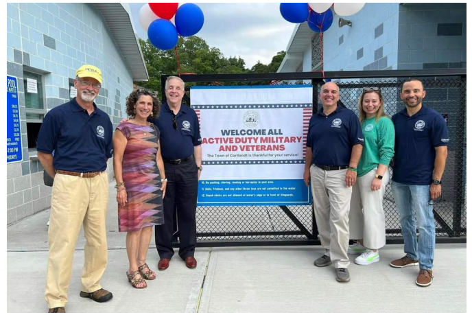
Honoring firefighters in Peekskill and veterans in Cortlandt.