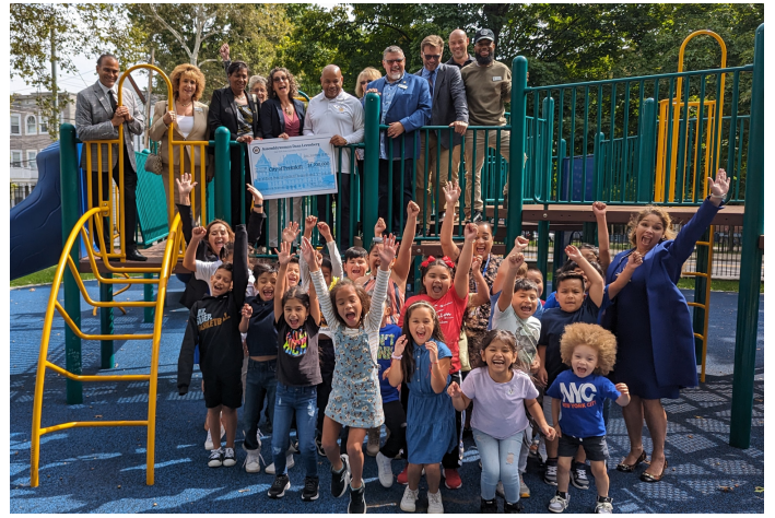
Photos from Assembly Speaker Carl Heastie's visit to Peekskill

as Sun River Health, she was a local pioneer in the ongoing effort to achieve health care equity. She was a visionary leader whose kindness and commitment to others were an inspiration to many. Peekskill and so many other Hudson Valley communities have been enriched by her efforts to bring high-quality health care to all. I was proud to attend her memorial service and honor her life with an Assembly citation, and I look forward to passing a resolution in memoriam when we return to Albany for the next legislative session.