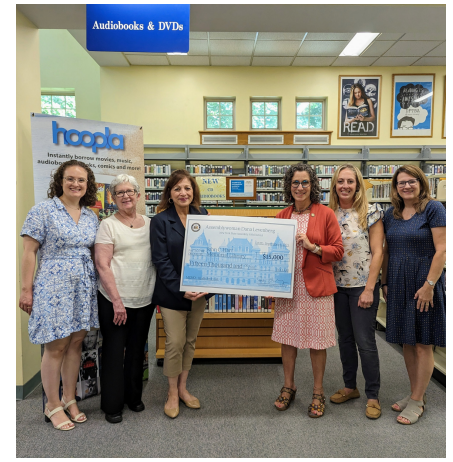
Left to right: celebrating the awarding of grant funding to the Julia L. Butterfield Memorial Library in Cold Spring, the Ossining Public Library, and the John C. Hart Memorial Library in Yorktown.