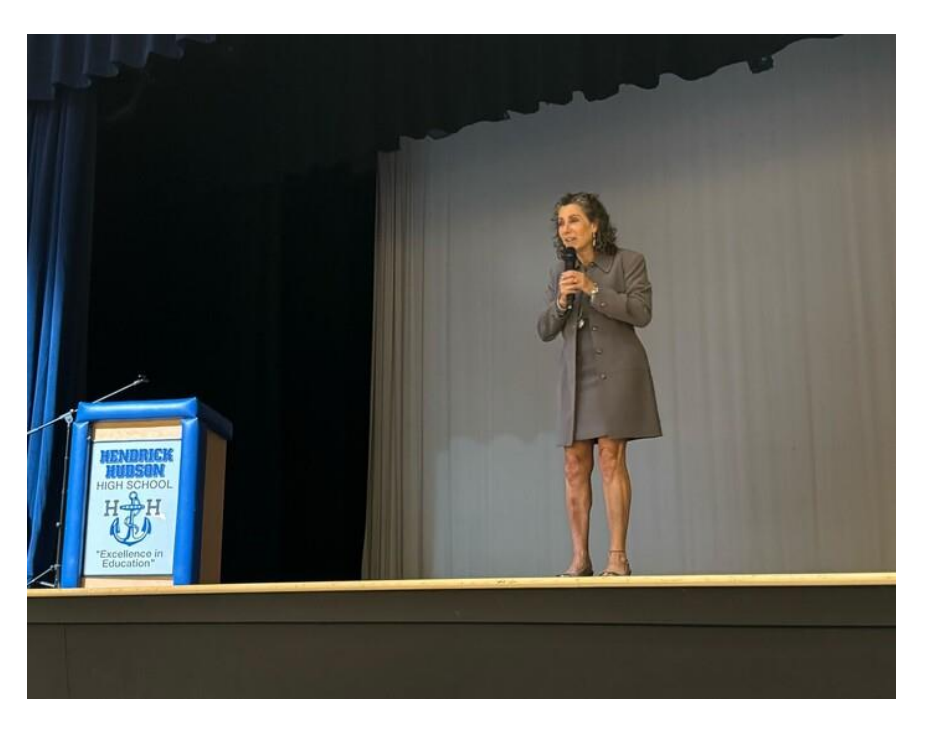
Greeting students on the first day of school

Happy first week of school! If school funding is on your mind, there is still a bit of time to submit written comments about the Foundation Aid formula as part of this year's Foundation Aid study. The public comment period for the study will close tomorrow, September 6; click here to visit the Foundation Aid Study web page and submit your comment using their form.