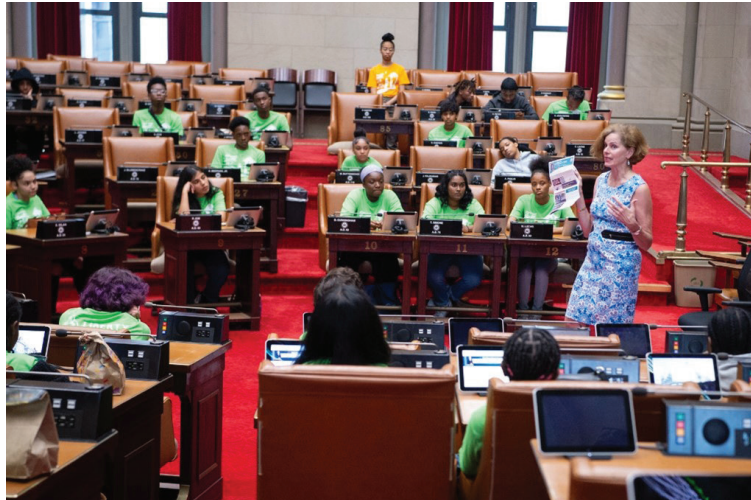
I welcomed students from Albany's Liberty Partnership Program this summer to the Assembly Chamber, and was happy to answer many of their questions about state government and the State Capitol!

More than half (52%) of the world's privately held sovereign debt is governed by NYS law. Oftentimes, a small group of hedge funds buy the debts of countries in crisis for pennies on the dollar, and force collection