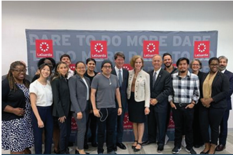
I was proud to visit CUNY's LaGuardia Community College as part of my statewide tour across New York State's higher education institutions, where it was great to see students from all backgrounds working towards their dream of achieving a higher education.

planning study be commissioned to help transform the Eastern end of the Harriman Campus to help better connect and integrate the campus and the overall project into the City of Albany, while gaining additional acreage for mixed-use development, green space, and multi-modal transportation.