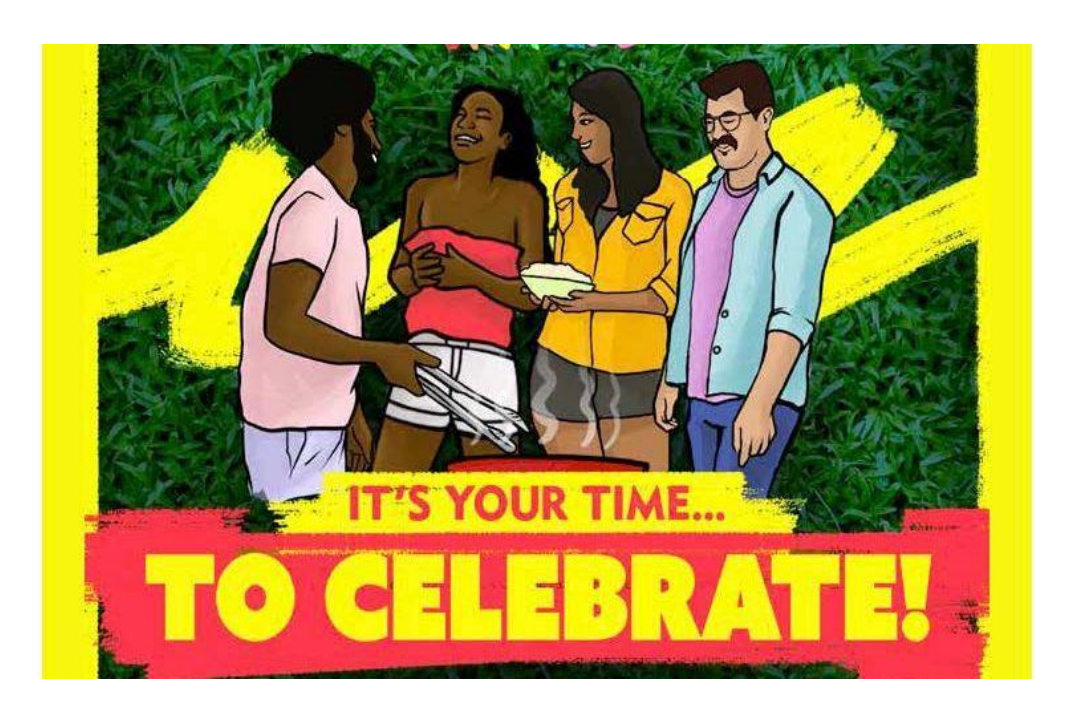
Advocating for Skilled Trades

On June 3<sup>rd</sup>, I joined <u>In Our Own Voices</u> for their substance-free picnic at Central Park in Schenectady to kick off Pride Month. It was great to be at an event, which provided members of the LGBTQ+ community with a comfortable atmosphere to celebrate their sobriety.