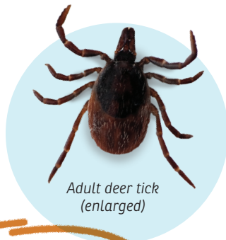
Adult deer tick (enlarged)

Lyme disease is a bacterial infection that can produce skin, arthritic, neurological and even cardiac symptoms. You can become infected through the bite of a deer tick that carries this bacteria. Not all deer ticks are infected, but avoiding tick bites and removing a tick as soon as you find it can reduce the likelihood of contracting Lyme disease or any other disease the tick may be carrying.