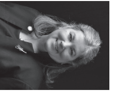
Assemblywoman Carrie Woerner