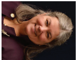
Assemblywoman Carrie Woerner