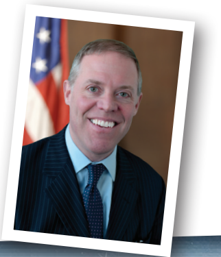
Will Barclay Member of Assembly

District Office 200 North Second Street Fulton, NY 13069 315-598-5185