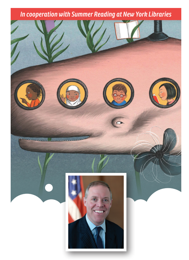
Sponsored by Assemblyman Will Barclay