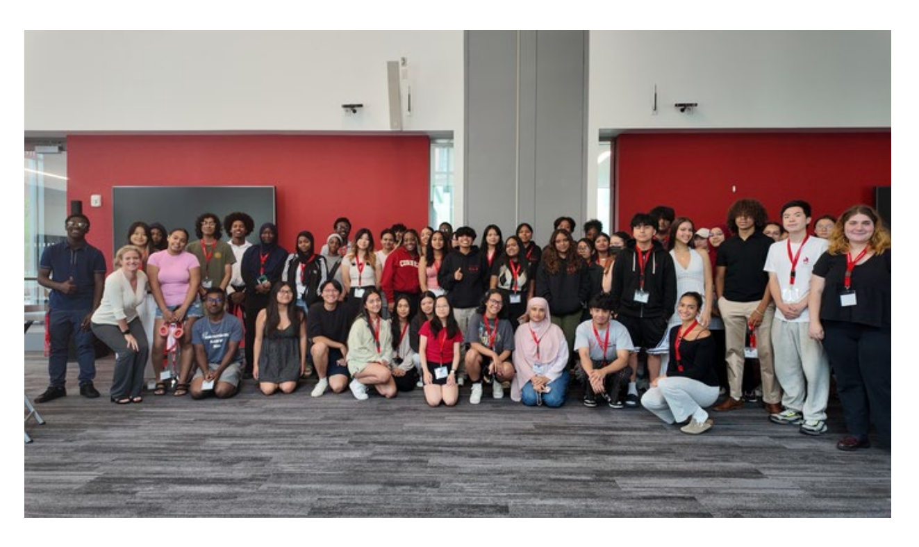
Cornell scholars celebrate the successful completion of a summer opportunity program before their first semester at college

adopted their rezoning, which allows for areas near the highway and town center to be more easily developed while preserving open space and residential properties further from the center. I look forward to having ongoing conversations with the community and supporting local businesses as they work to grow a vibrant walkable town center.