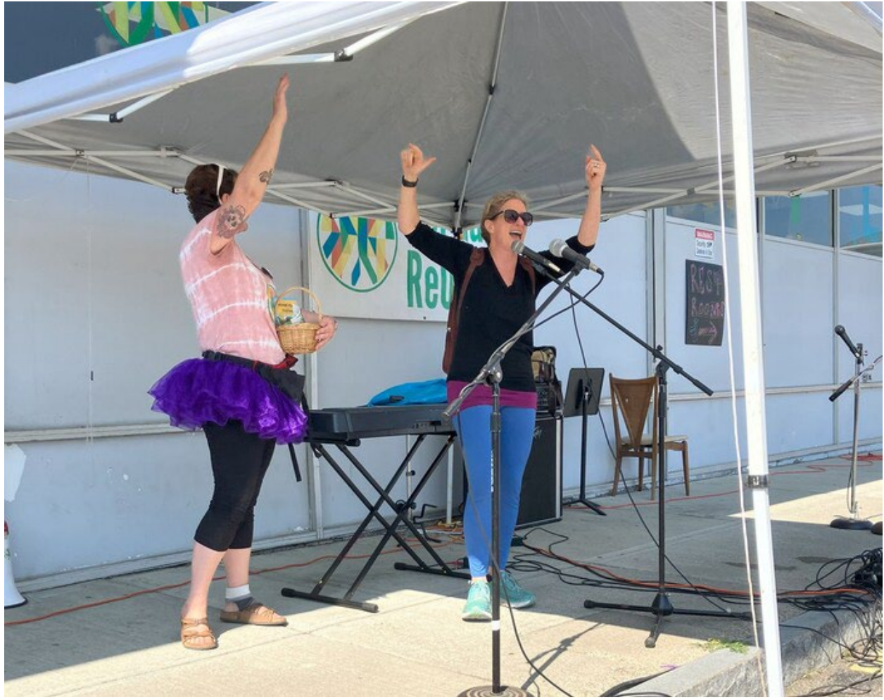
Speaking at the Cortland ReUse celebration Sept. 14

I participated in the Cortland ReUse grand reopening celebration Saturday, Sept 14, speaking to the importance of a <u>circular economy</u> and how organizations like Cortland ReUse serve this mission. According to the most recent <u>Department of Environmental Conservation (DEC) Solid Waste Management Plan</u> we have between 16-25 years left of all N.Y. landfills after which time we will have to use taxpayers' dollars to pay premium prices to ship our waste outside of the state. Yet much of the material we send to landfills still has significant inherent value. If we are willing to take the time and care to repurpose these materials it can generate billions of dollars in state revenue, many thousands of jobs, reduced water and air pollution, and produce significantly less greenhouse gas emissions. Cortland ReUse is one of the many organizations across the state promoting the importance of refurbishing and reusing items, rather than throwing them away into our already rapidly-filling landfills. In its third year at its new location at 186 Homer Ave, Cortland ReUse accepts everything except clothing. They partner with community organizations like Catholic Charities and <u>Cortland County Department of Social Services</u> (DSS) to help people