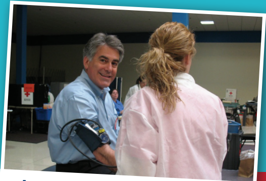
Assemblyman Stirpe donates blood at a previous Lifesavers Blood Drive