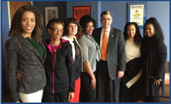
Members of Jubilee Homes visited Assemblyman Magnarelli's office in Albany to discuss revitalization of Syracuse's Southwest Neighborhood.