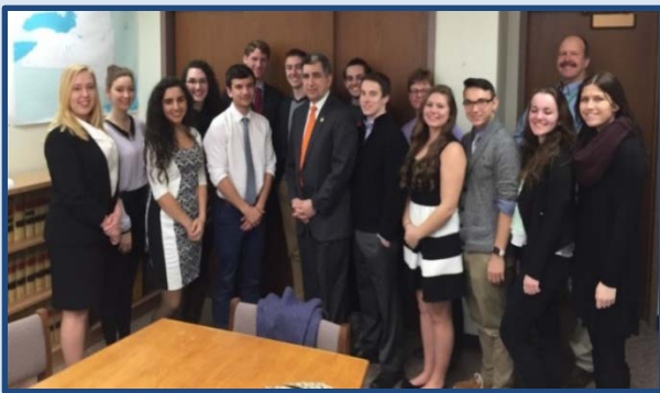
West Genesee Students got a first-hand experience in advocating for education funding during their recent trip to Albany.