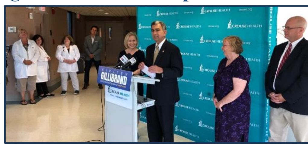
Assemblyman Magnarelli is pictured with Senator Gillibrand and County Legislator Peggy Chase, a registered nurse.

Assemblyman Magnarelli attended an event hosted by Sen. Kirsten Gillibrand at the Crouse Hospital Marley Education Center. The Senator was in Syracuse to advocate for legislation in Washington to control the cost of prescription drugs. The Senator recently introduced the "Stop Price Gouging Act" that would place penalties on pharmaceutical companies that impose excessive, unjustified price increases on their products. The Assemblyman agrees with the Senator