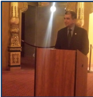
Assemblyman Magnarelli speaks at the ribbon cutting ceremony of the Landmark's new elevator.

Assemblyman Magnarelli at the announcement of the Landmark's 2019-2020 season.