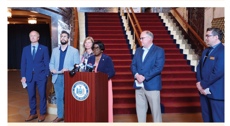
Assembly Majority members announce $1.2 million in operational funds for Shea's Theater as part of 'Alive Downtown' $5 million in statewide funding for historical theaters recovering from COVID. These are the first operational state funds that Shea's has ever received.