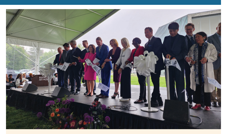
Majority Leader and other dignitaries celebrate the grand re-opening of the Albright Knox Gundlach (AKG) Art Museum on June 12, 2023. The project cost $230 million, with the Assembly Majority contributing over $9 million. The AKG now has a free and accessible Ralph Wilson Indoor Town Square with the popular Common Sky permanent art installation.