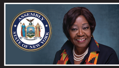
Hon. Crystal D. Peoples-Stokes

New York State Assembly Majority Leader 141st Assembly District